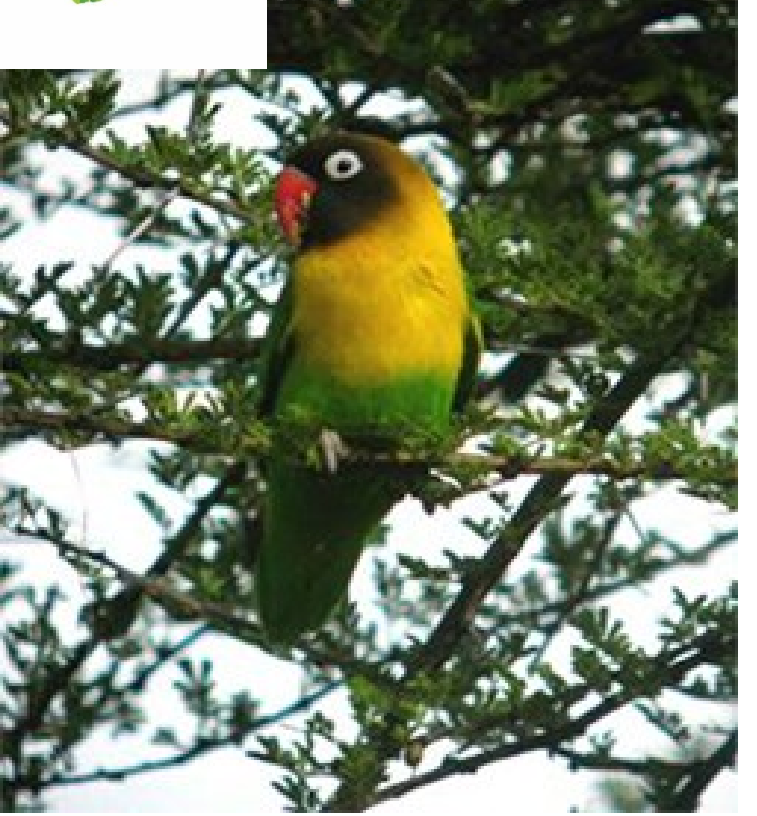
Yellow-collared lovebirds stay local with one of the smallest ranges among East African birds.