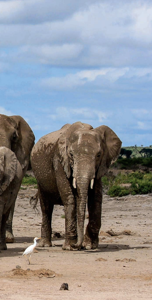
An African elephant matriarch (center) can lead, and shape the success of, a family for three decades or more.

Positive conservation outcomes can depend on the restoration of cultural knowledge. For example, because whooping cranes learn migratory routes socially, human surrogates in ultralight aircraft can guide naïve, captive-bred birds along their first migration, potentially boosting the effectiveness of reintroduction programs (8, 9). Similarly, without the benefit of socially inherited knowledge, bighorn sheep and moose translocated to unfamiliar habitats can take generations to master the skill of tracking the seasonal distribution of high-quality forage (10). Social learning can also be exploited to ameliorate human-wildlife conflict, for example, by artificially “seeding” desirable behavior, such as avoidance of particular foods or sites (3, 11).