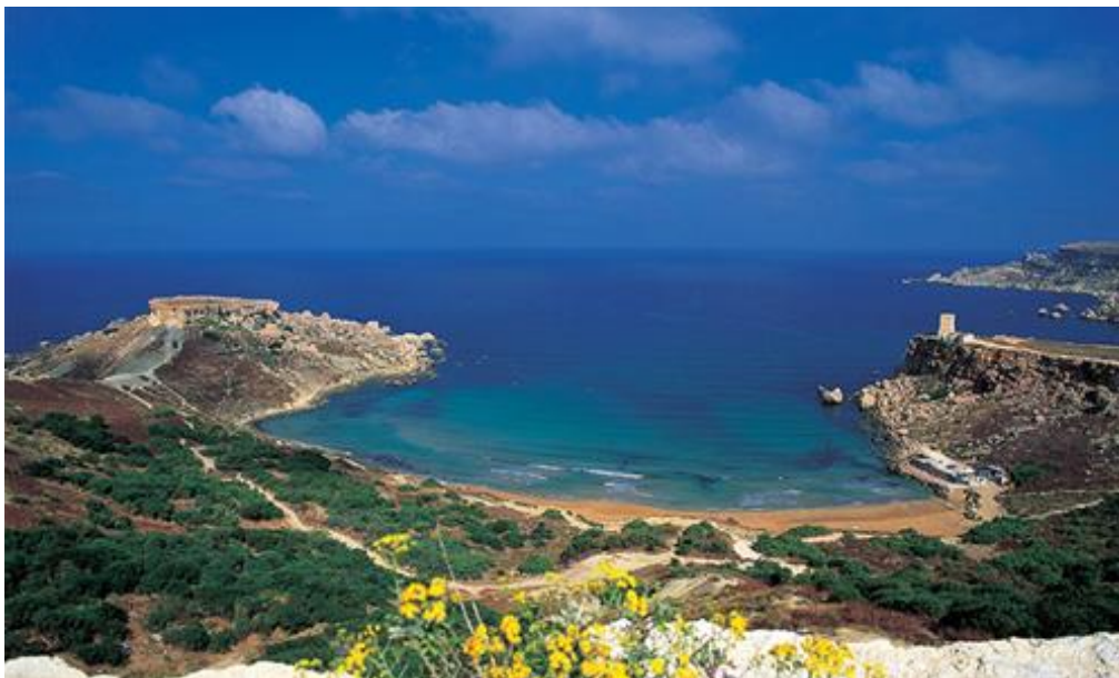
Ghajn Tuffieħa Bay

The country is a popular tourist destination with its warm climate, numerous recreational areas, and architectural and historical monuments, including nine UNESCO World Heritage Sites: Hal Saflieni Hypogeum, Valletta, and seven Megalithic Temples, which are some of the oldest free-standing structures in the world.