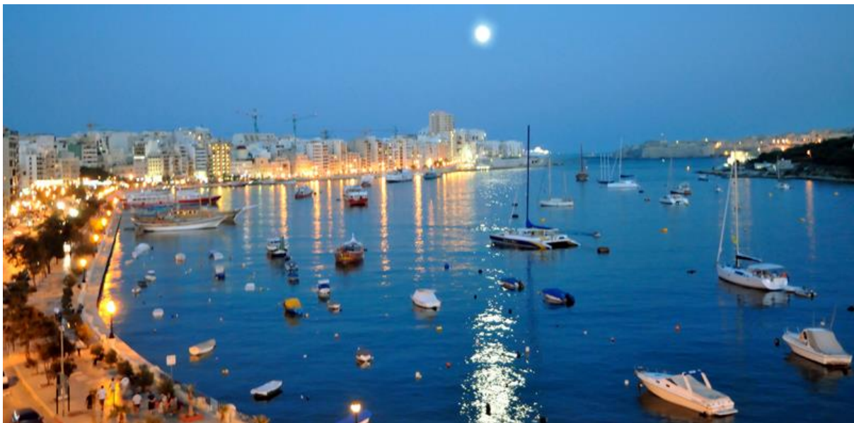
The Strand in Sliema

For further information about Malta and related tourist information, please refer to: www.visitmalta.com