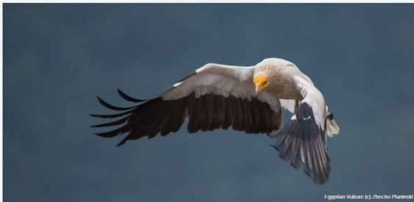
Egyptian Vulture