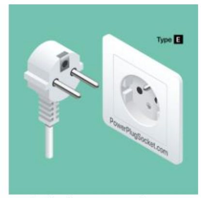
Slovakia Plug & Power Outlet Type E