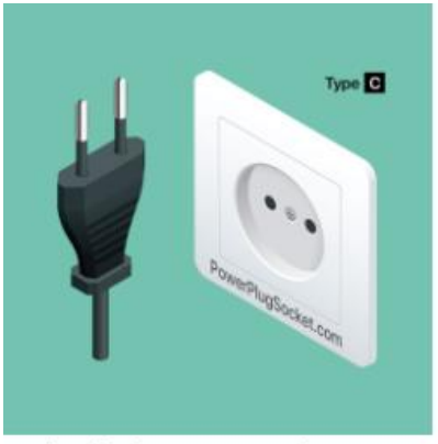
Slovakia Plug & Power Outlet Type C

In Slovakia the power plug sockets are of types C and E with standard voltage between 220 – 240 V: