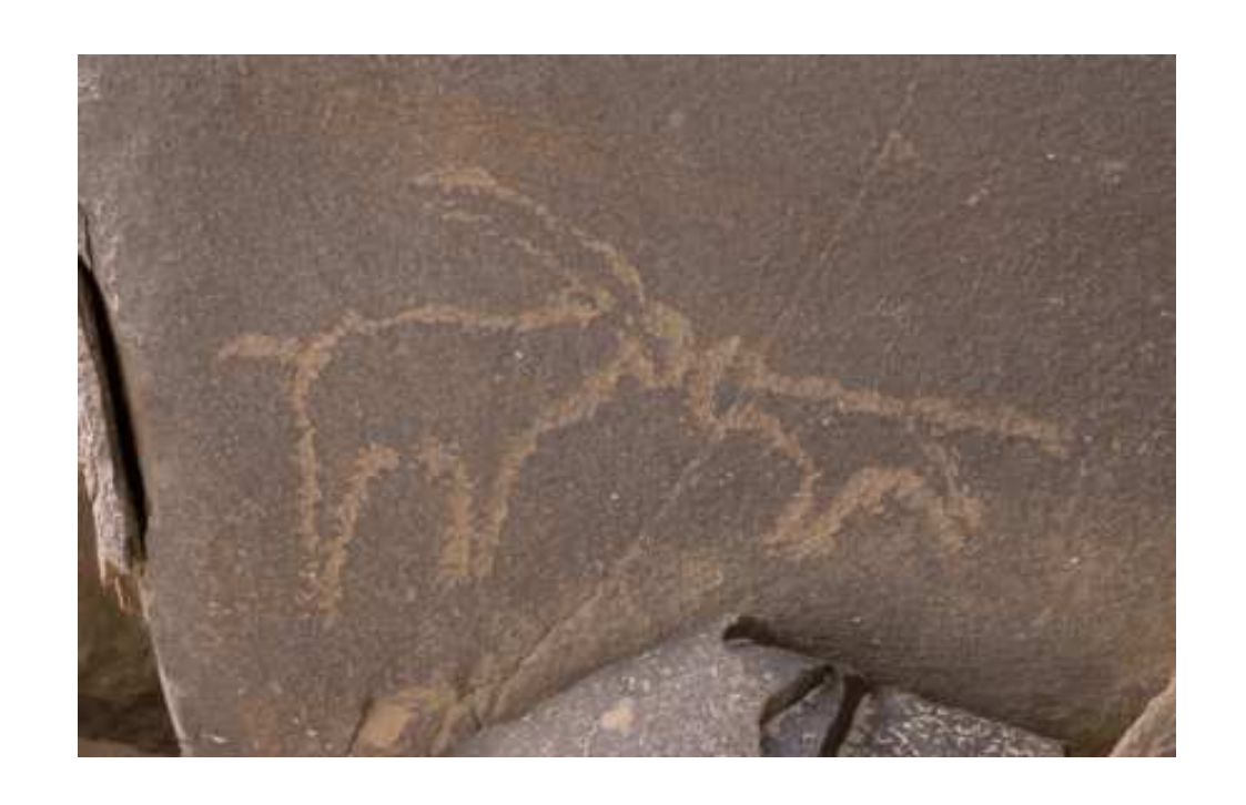
Oryx dammah. Engraving. Niger