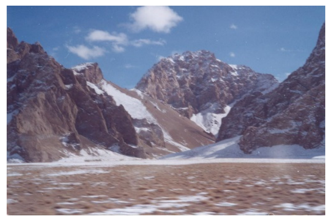
Sarykol Range, Tajikistan-China border.

Human barriers consist of border fences and minefields. An inner border fence 350 km long was erected between Tajikistan and China during the Soviet era, but in places the posts have been cut for firewood so there is no longer a complete barrier (Schaller and Kang 2008). A new fence is reportedly under construction on the Chinese side of the border. Fences also exist along parts of the Tajikistan-Afghanistan and Uzbekistan-Tajikistan borders. So far, such fences extend along a relatively small part of Snow Leopard range, so this threat remains localized in the region, although it could quickly become