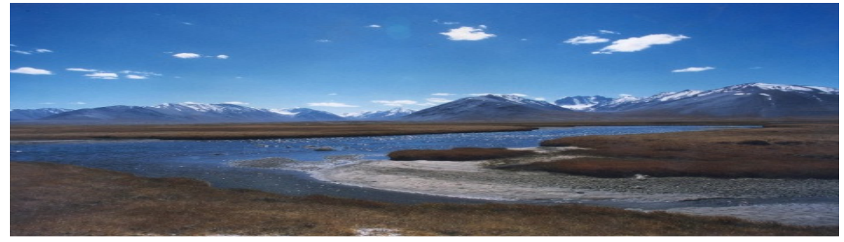
Zorkul, Eastern Pamir.

Covers the South Alichur, Wakhan and Sarykol ranges in Tajikistan, the Afghan and Chinese Pamir and a small area of Pakistan. Includes Zorkul SNR (877 km<sup>2</sup>), Murgab hunting management area (2000 km<sup>2</sup>), and Vakhan hunting management area in Tajikistan; Wakhan NP (11,457 km<sup>2</sup>) in Afghanistan, which itself covers Big Pamir Wildlife Reserve (577 km<sup>2</sup>) and Teggermansu Wildlife Reserve (248 km<sup>2</sup>); Taxkorgan NR (15,863 km<sup>2</sup>) in China, and Khunjerab NP (2269 km<sup>2</sup>) and Kilik-Mintaka Game Reserve (650 km<sup>2</sup>) in Pakistan. The landscape thus described is broadly the same as the Pamir International Conservation Area (Schaller 2005, WCS 2007), coincides with the distribution of the Marco Polo sheep Ovis ammon polii and encompasses GSLEP landscapes in Afghanistan, China, and Tajikistan.