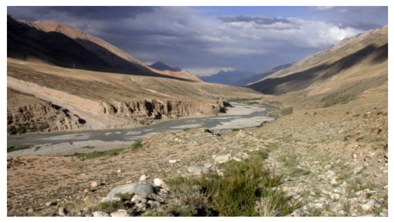
Sarychat-Eertsah Reserve.

Encompasses the area from Sarychat-Eertash SNR (1341 km<sup>2</sup>) to the new Khan Tengri SNP (3257 km<sup>2</sup>) on the eastern borders with China where it adjoins Tuomuerfeng (Tomur) Nature Reserve (2376 km<sup>2</sup>) and Kazakhstan. It also includes Karakol SNP (160 km<sup>2</sup>), and the Dzhety-Oguz (300 km<sup>2</sup>) and Tyup (150 km<sup>2</sup>) sanctuaries, and the area between, most of which is occupied by hunting concessions. Also included is Jangart, lying between the southern side of Sarychat-Eertash to the border. The landscape also potentially extends westwards to 4a Naryn SNR (183 km<sup>2</sup>) and sanctuary (400 km<sup>2</sup>), with which it is connected by more hunting concessions. The GEF/UNDP Central Tien Shan Project is planning to establish wildlife corridors covering 2663 km<sup>2</sup> between SCEZ and KTNP (section 3.2). Most of the Kyrgyz sector and Tomur Reserve in China are included in the GSLEP 20 x 2020.