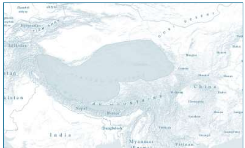
Kiang range map

Kiang ( Equus kiang ) – The kiang or Tibetan wild ass (CMS Appendix II) is the largest of the wild asses and a native of the Tibetan Plateau. Its current range is restricted to Ladakh in Jammu and Kashmir, the plains of the Tibetan Plateau and northern Nepal along the Tibetan border (Shah 2008). Within this broad range, kiang distribution has become increasingly fragmented. The most recent population assessments were completed in 2008, showing 90 per cent of the population of 60,000-70,000 animals in