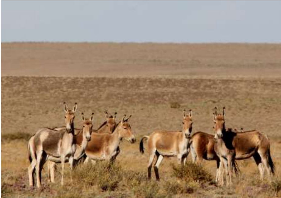
The khulan's range has been reduced to the Gobi Desert and similar environs, where access to adequate grazing and water means traveling long distances.