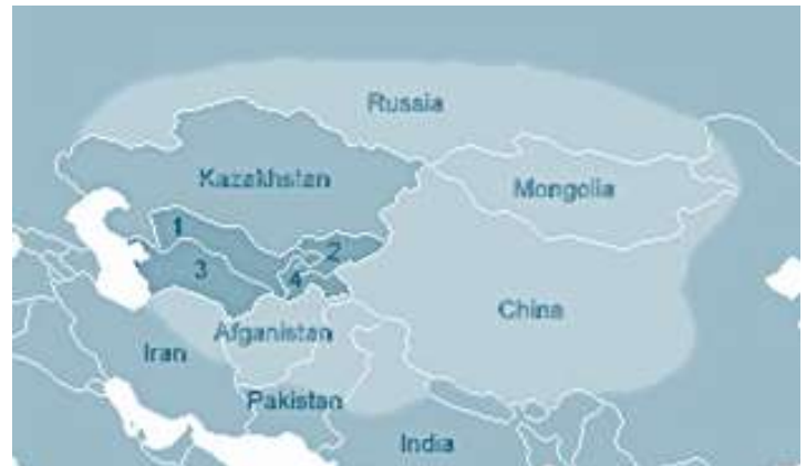
Figure 1: Map of Central Asia