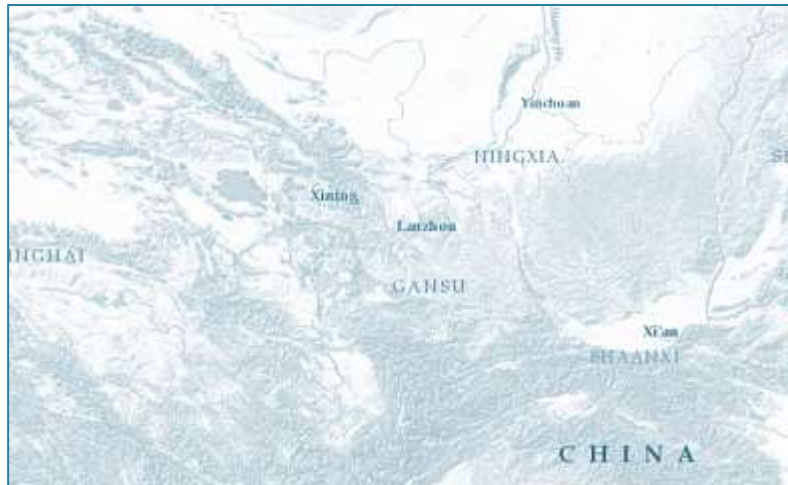
Przewalski's gazelle range map