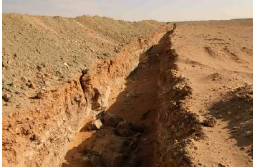
Ditches created during the construction of pipelines or as a measure to prevent vehicles from leaving established roads represent another hazard and potential barrier to wildlife movement.