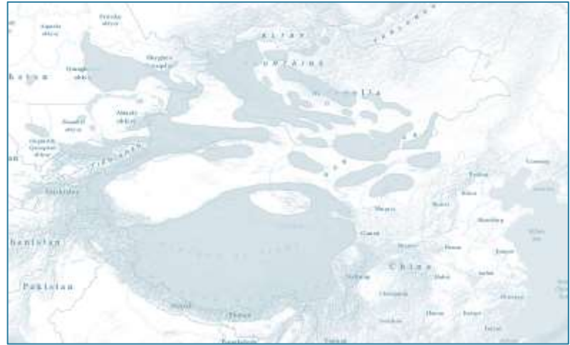
Argali range map

Argali ( Ovis ammon ) – The argali sheep is the largest of the world’s wild sheep, with a range covering eleven countries in Asia. Argali sheep live on highlands, consisting of mountains, steppe valleys, and rocky outcrops (Reading et al. 1998). Very few scientifically accredited population counts exist for argali in their range countries (Mallon et al. 2014). There are currently nine different recognized subspecies, seven of which are listed in Appendix II of CITES and CMS. They are classified as vulnerable on the IUCN Red List Category.