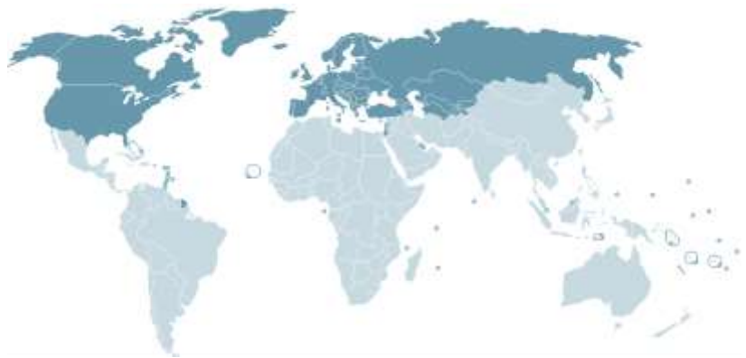
Figure 2: Map of UNECE Member Countries