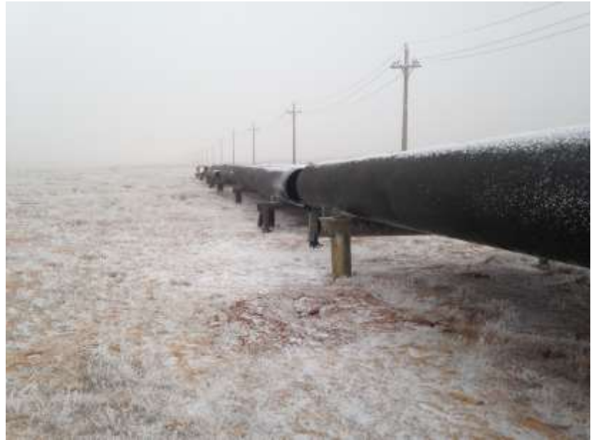
Pipelines can be significant barriers to large mammal movements. However, placement of pipelines underground can often solve this problem.

Barrier Effects – Pipelines are not buried across their entire length and there is evidence that, where not buried, deflections of wildlife will result causing at least a partial barrier effect. It is not known how severe avoidance would be in the Central Asian context as the issue has not yet