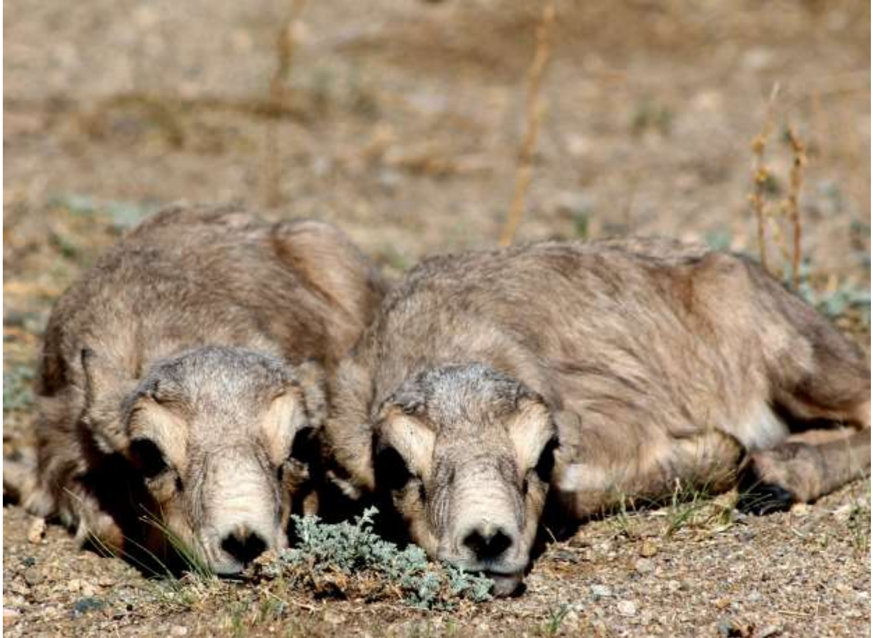
Saiga antelope make long-distance southern migrations to avoid harsh winter weather and return to the north in the spring to find good forage and calving grounds.

Being in one or the other category is not intended to imply any difference in the applicability or enforceability of a particular mandate, or its importance in the overall management scheme. A single provision in a related law may indeed prove to be the most important for a given species or linear infrastructure development. Nor is it intended to suggest that because one type of law (e.g., an endangered species law) is considered 'Related' for one country, that it must be in this category for all other countries. The distinction is entirely content-dependent.