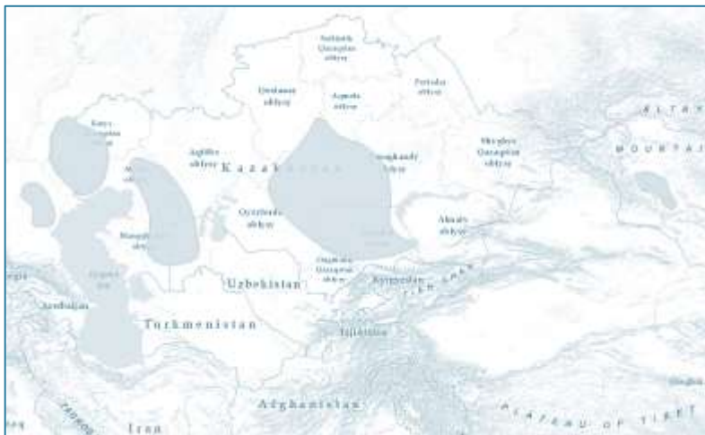
Saiga antelope range map

The most recent count states that the global population of goitered gazelle is 120,000-140,000. However as mentioned, it is estimated that this number has seen dramatic declines among most populations (Mallon and Kingswood 2001).