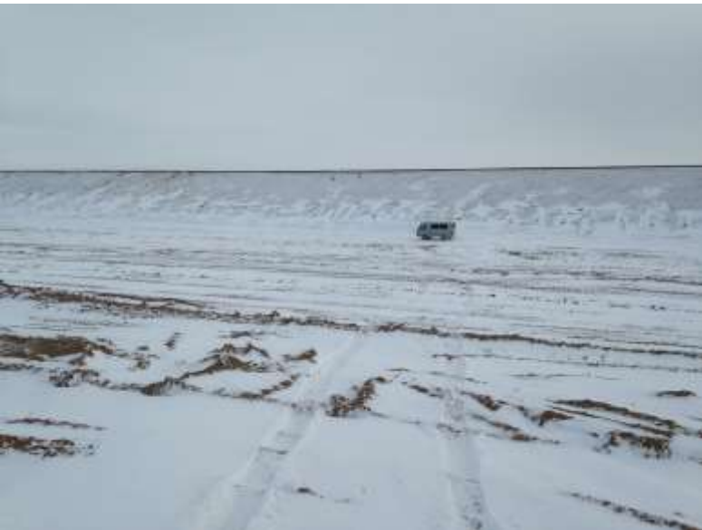
Railway berms can be a significant barrier to migratory steppe ungulates unused to steep inclines.

Barrier Effects – As described by Olson (2011), an unfenced rail line has at least three barrier components 1) the embankment constructed as the rail bed, 2) the tracks, and 3) the traffic volume. Each of these represents a separate barrier effect that can prove difficult, even impossible, for some species. Rail line embankments are the first barrier and can either be too high to climb, constructed of material (e.g. loose gravel or large stones) unsuited to some species, or simply discourage crossing because of their visual effect to species used to long lines of sight. Even if the embankment is passable, the rails can represent a potential deterrent to larger mammals unused to crossing ‘broken ground.’