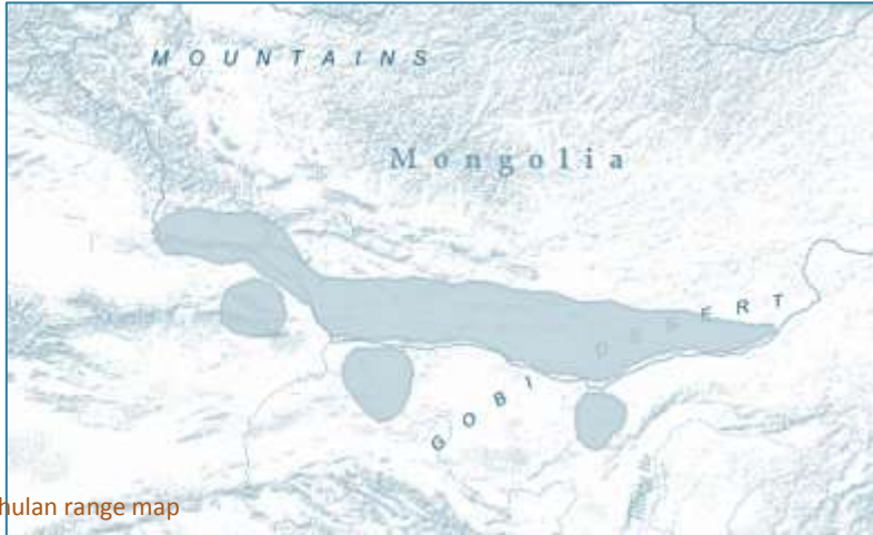
Khulan range map

Khulan ( Equus hemionus ) – The khulan or Asian wild ass is found today in southern Mongolia and parts of northern China. Historically, they were also present in Kazakhstan before being exterminated through hunting. Khulan are now listed as an endangered species on the IUCN Red List and scientific evidence suggest that abundance has declined globally by more than 50 per cent over the past two decades (Moehlman et al. 2008). They are also included in Appendix I of CITES, and Appendix II of CMS. Mongolia’s population comprises 80 per cent