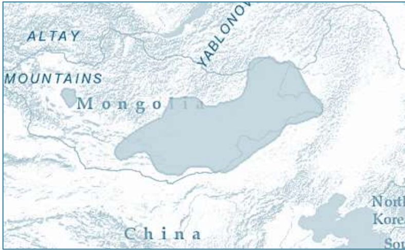
Mongolian gazelle range map

No regular migration pattern has been observed in kiang. They do, however, make seasonal movements between different habitat types, often dispersing in small groups into hilly terrain in summer, and concentrating in basins and flat terrains during winter (Schaller 1998). Livestock fencing may be a threat as it fragments habitat on the plateau and can limit movement.