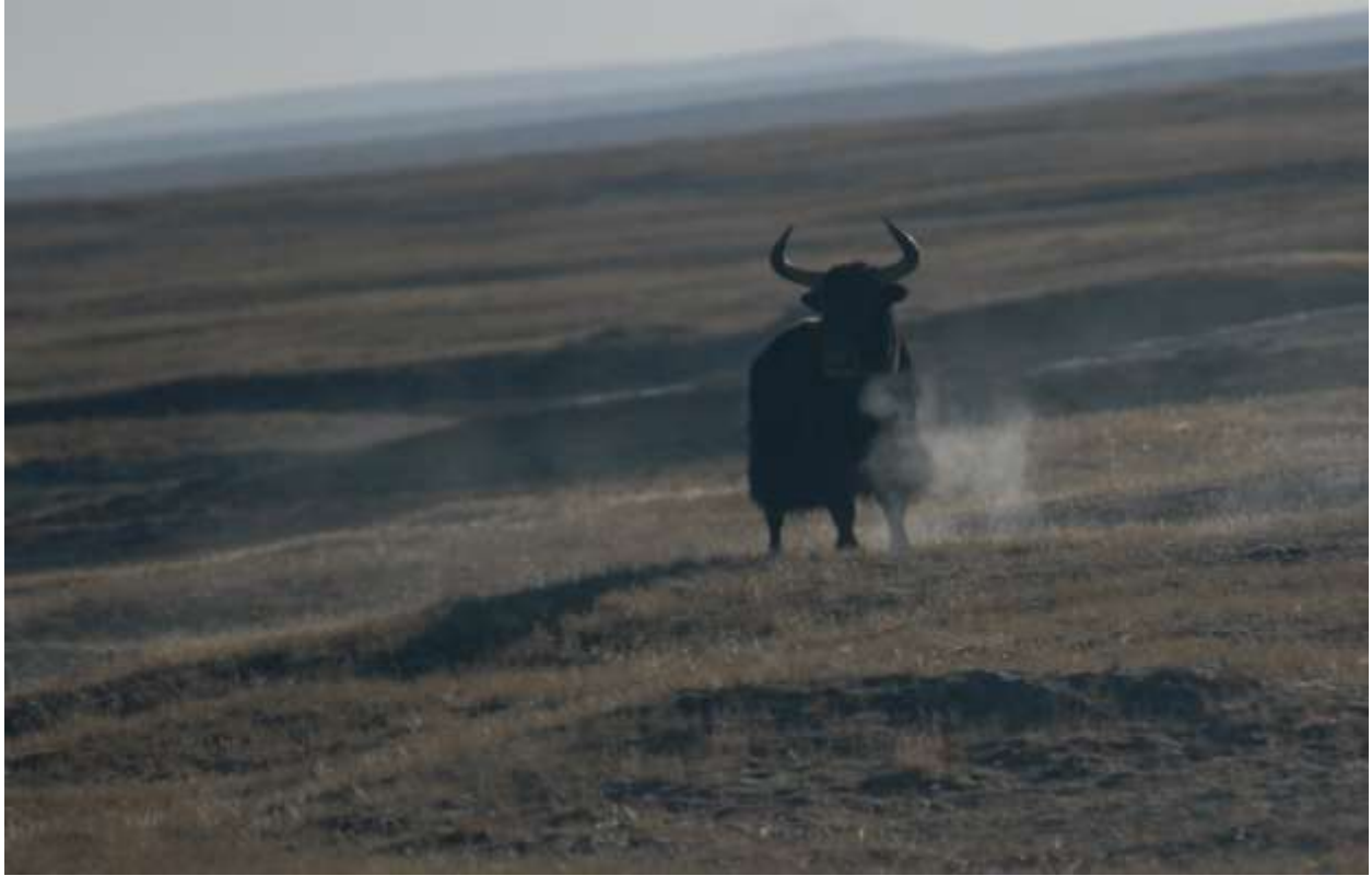
Wild yak bull.