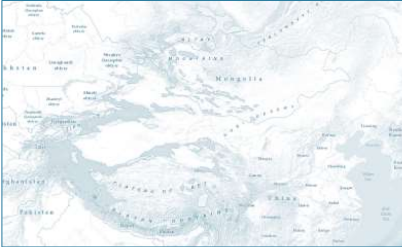
Snow leopard range map

Snow Leopard ( Panthera uncia ) – The snow leopard lives on the mountain ranges of South and Central Asia, comprising twelve countries and 1.2 million km 2 of potential habitat. With an estimated population of 3,000-7,500 individuals, they are listed as an endangered species on the IUCN Red List, and are included in Appendix I of CITES and Appendix I of CMS (as Uncia uncia ).