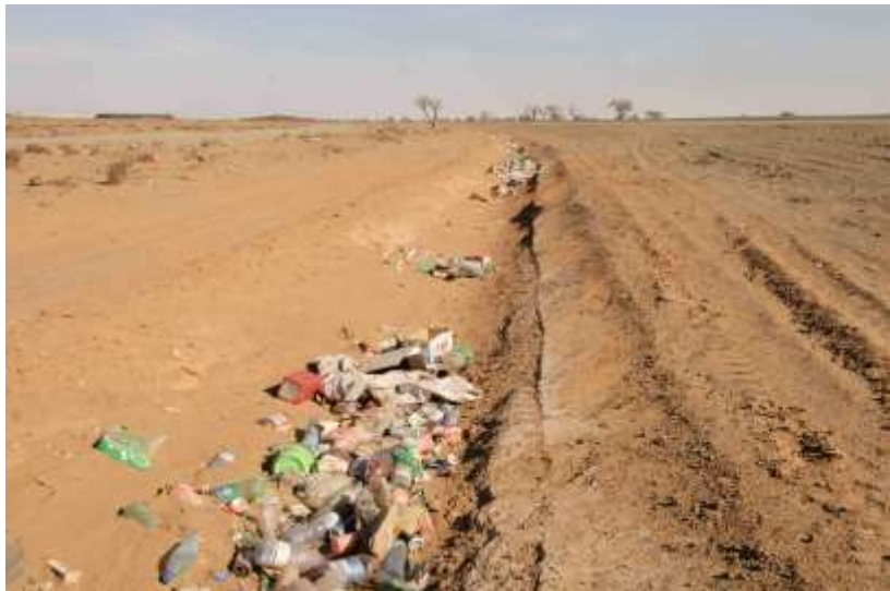
Trash is often associated with linear infrastructure development, negatively impacting the environment and species health.