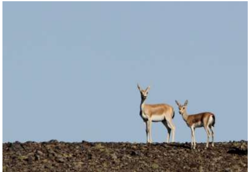
Goitered gazelle live in desert environments and must have access to large areas in order to find adequate food in this hostile environment.

Governments and development proponents are faced with the serious challenge of considering not just where a species is likely to encounter a development based on known movements, but where it is likely to go now and in the future in search of new habitat. This is potentially where local knowledge can play role in helping governments and developers