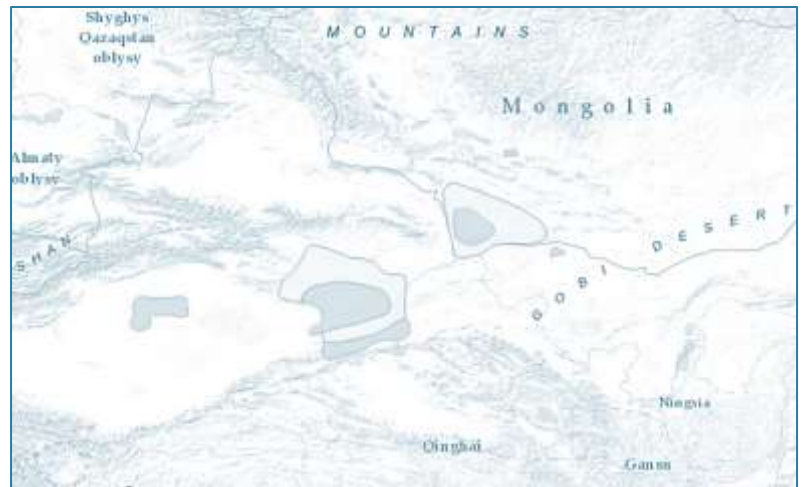
Bactrian camel range map

Bactrian Camel ( Camelus ferus ) – The Bactrian camel is only found in three locations in northern China (one in the Taklamakan and two in the Lop Nur Desert) and one location in southern Mongolia (Transaltai Gobi; Hare, 2008). The species' distribution in Mongolia is reported to have shrunk by ~70 per cent since the last century, and possibly as early as the 1940s (Adiya et al. 2012, Bannikov 1975).