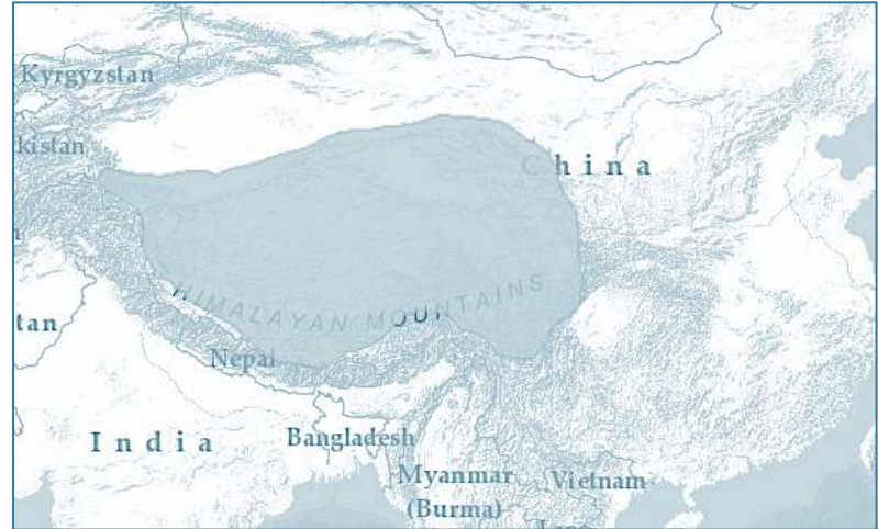
Tibetan gazelle range map

Tibetan gazelle are small antelopes that have black-tipped tails on their white rumps. Also known as goa, they live on the Qinghai-Tibet Plateau, on high-altitude plains, hills and stony plateaux. The lack of ecological information on this species hinders conservation planning (Namgail 2008). They are classified as Near Threatened on the IUCN Red List, since their population is estimated to have declined by 20 per cent over three generations. Their population on the Qinghai-Tibet Plateau is estimated to be 100,000, with some degree of uncertainty (Schaller, 1998). They are considered under threat from the continued increase in habitat loss and fragmentation from land alteration for agriculture, increasing livestock numbers and the fencing of land on the Tibetan Plateau.