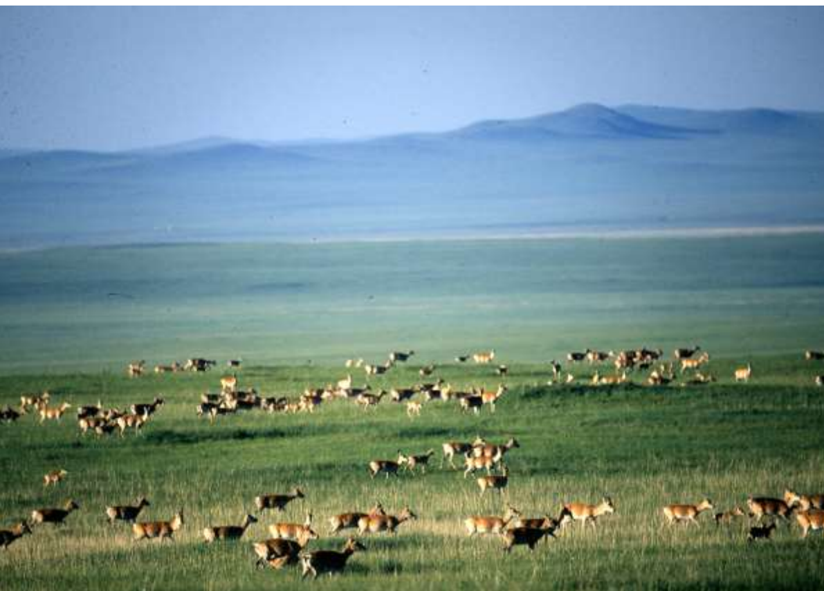
Mongolian gazelle travel long distances in large herds across Mongolia’s steppe in a nomadic fashion in search of forage and to avoid winter weather.

CMS provides the ideal international policy frameworks to facilitate close collaboration amongst stakeholders. CMS policies include the removal of barriers to migration, the building of transboundary ecological networks (e.g. Resolution 10.3) and the maintenance of animal migration in Central Asia as one of the last global “migration hotspots”. Through developing an initiative for Central Asian mammals, the treaty is acting as a catalyst to foster collaboration between all stakeholders, with the aim to harmonize and strengthen the implementation of CMS and its instruments targeting large mammals.