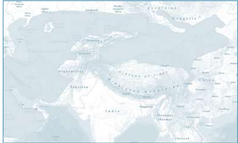
Goitered gazelle range map

Goitered Gazelle ( Gazella subgutturosa ) – Goitered gazelle (CMS Appendix II) occur in the Arabian Peninsula across the Middle East and Asia to Kazakhstan, Mongolia, China and Pakistan. They are distributed in approximately 20 countries. Found in arid desert and desert-steppe habitat, they move seasonally in search of pasture and water, and they can cover up to 30 km per day in the wintertime. In the summertime, their average travel distance is substantially less. With a running speed of up to 60 km/h, they are prone to flee when in contact with humans and other creatures with which they seek minimal association.