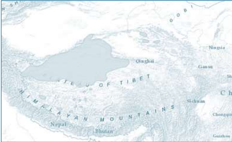
Wild yak range map

Wild yak ( Bos mutus ) – Wild yak live on remote, high-elevation alpine steppe and meadows primarily on the Tibetan Plateau at 3,000-5,500 metres in elevation (Leslie and Schaller 2008). Their range consists of Tibet, Qinghai and Gansu provinces in China. They are listed as Vulnerable by IUCN, included in Appendix I of CITES (and listed on Appendix I of CMS as Bos grunniens ), and they are considered one of the most endangered species in the Tibetan Plateau. It is estimated that there are less than 15,000 wild yak today.